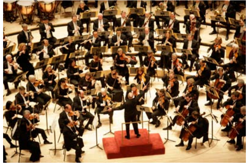
The Chicago Symphony Orchestra and conductor David Zinman at Miami's Carnival Center for the Performing Arts on February 13, 2007.